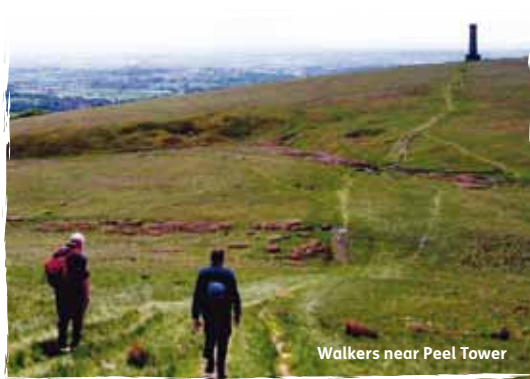
Walkers near Peel Tower