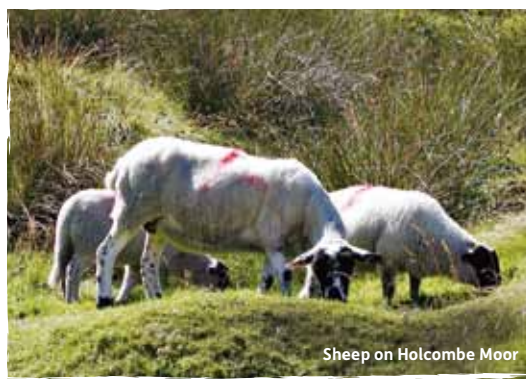
Sheep on Holcombe Moor